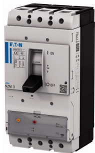
NZM3 PXR10 circuit breaker, 630A, 4p, screw terminal

Part no. NZMH3-4-AX630 Catalog No. 191389