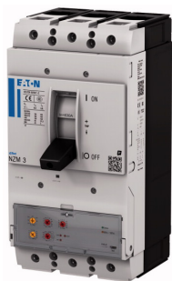
NZM3 PXR20 circuit breaker, 400A, 3p, screw terminal