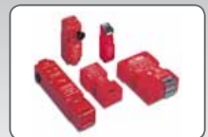
Tongue and hinge switches