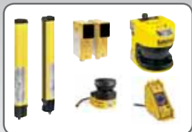
Safety light curtains, camera and scanners