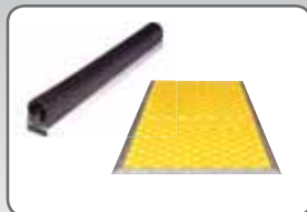
Pressure sensitive devices