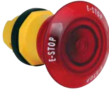
Trigger Action E-Stop Units, Illuminated