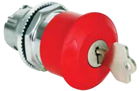
Trigger Action E-Stop Units, Key Release