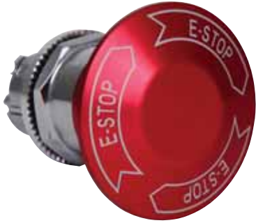
Trigger Action E-Stop Units, Non-Illuminated

The Allen-Bradley 800T/H push button product lines are designed and constructed to perform consistently in the most demanding industrial environments. This legacy of leadership continues with the introduction of the innovative 800T/H trigger action e-stop devices.