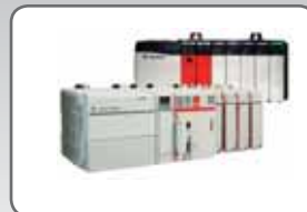
GuardLogix and Compact GuardLogix