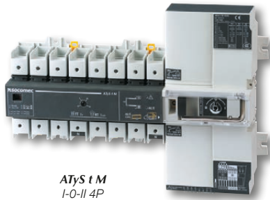
ATyS t M 1-0-II 4P