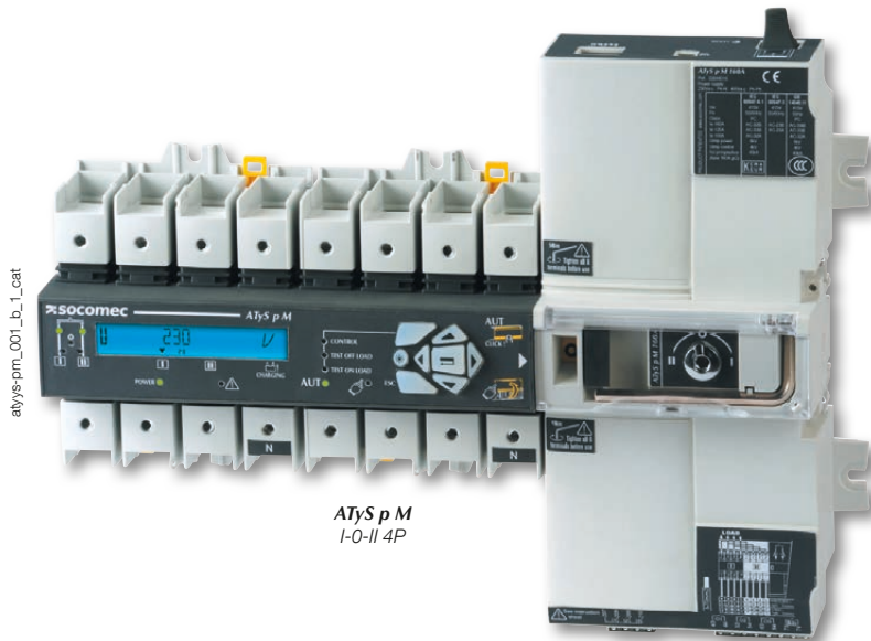
ATyS p M I-0-II 4P